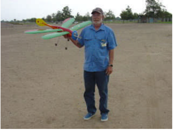
Canadian Bug by Jerry Laux

The Canadian Bug was designed by Laddie Mikulasko. It is a take off of Dick Tichnor's Dickie Bug, which was powered by a 049 fuel engine, with rudder, elevator controls, and was a bit smaller in wing size. The Canadian Bug has a 44 inch wingspan, 5 inch cord, 440 sq. in. area flat bottom airfoil, inch and one half dihedral in the front wing and no dihedral in the rear wing. The controls are Elevon and Rudder. The flying weight with brushless motor and three cell lipo battery is approx.28 to 30 oz. According to the story, this is a full scale model of a