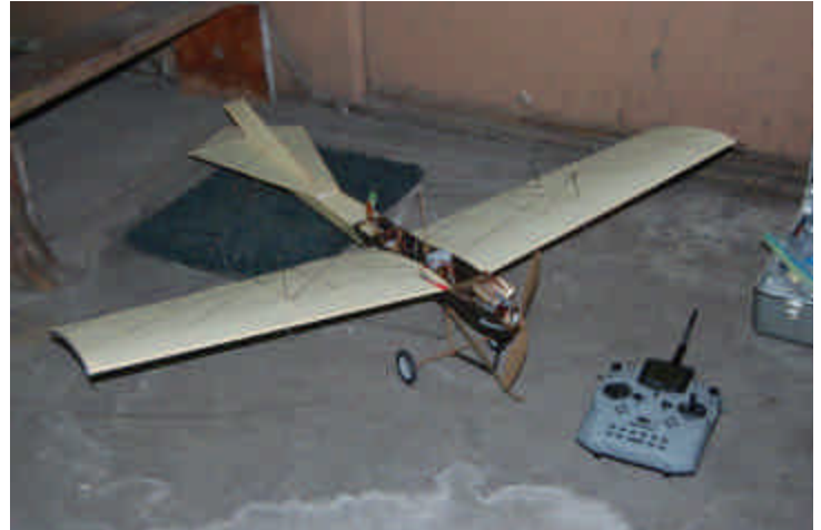
Scale electric RC models were quite popular as shown above and below left.