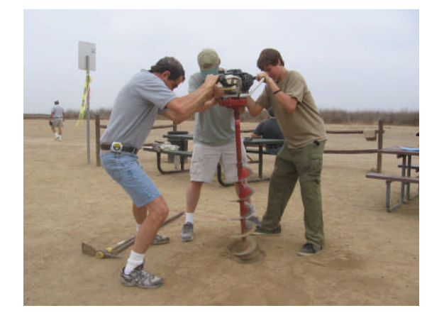
Post hole digging "Hard Going"