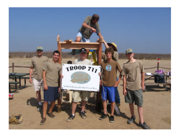
Raising the Roof"