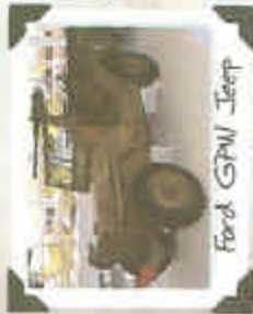
Ford GPW Jeep