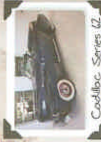
Cadillac Series 62