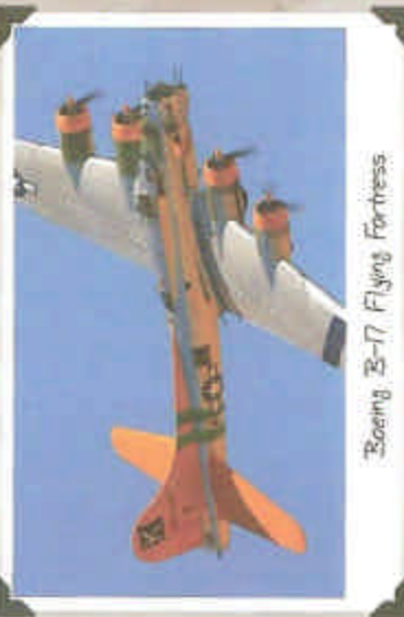
Boeing B-17 Flying Fortress