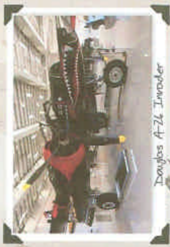
Douglas A-26 Invader