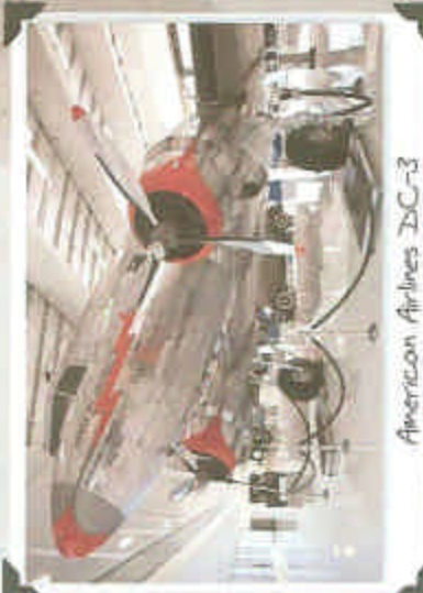
American Airlines DC-3