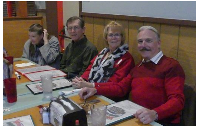
Enthusiastic HSS members clustered about the dining tables at Woody's Diner.