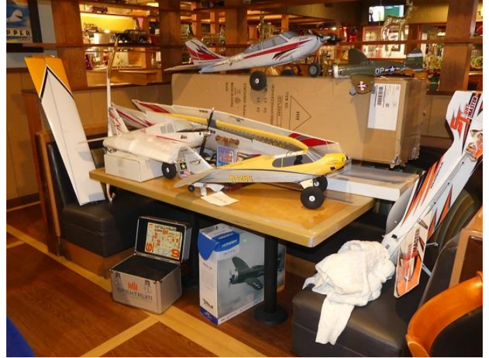
Raffle prizes. Quite a haul.